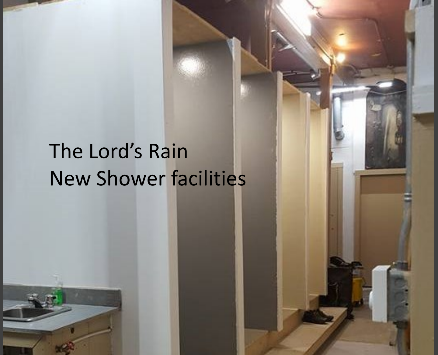
The Lord's Rain New Shower facilities