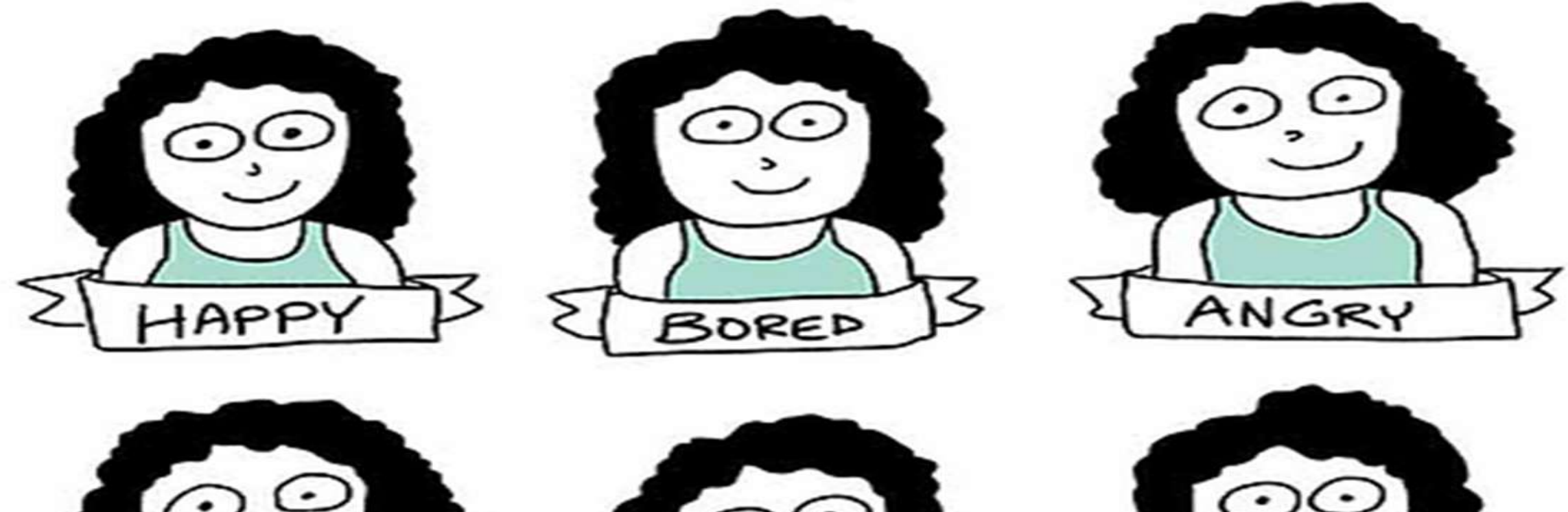
The Cooper Review.com